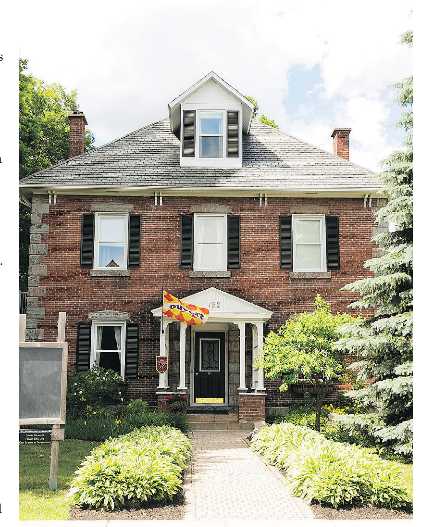
Auberge Nuits St-Georges, rating 9.2/10 on hotels.com and designated as "Loved by Guests," is an architectural treasure on Bromont's main street.

The exciting menu features rarities like elk with apples, boar with huckleberries, bison ravioli and wild hare with juniper. Creative appetizers include scallops with sea urchin foam,